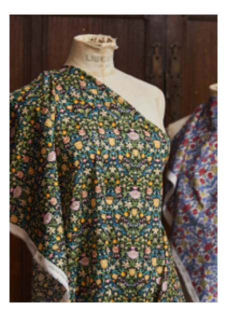
The Art of Craft by Liberty Price per metre: £29.95

Classic Arts and Crafts motifs, intricate detail and rich hues populate Liberty's new capsule collection of ten fabrics, conceptualised and designed in the Liberty Fabrics studio.